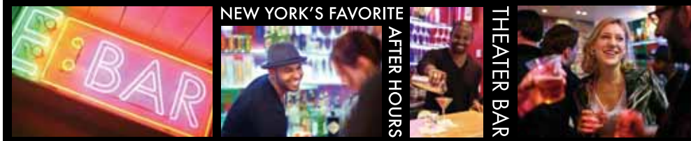
Design: Mase Manhattan 646.361.0764